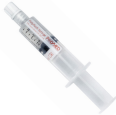
Single Sterile, SS 3ml 30 pcs/box REF: 90311