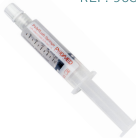
Single Sterile, SS 5ml 30 pcs/box REF: 90319