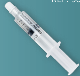
Double Sterile, DS 3ml 30 pcs/box REF: 90317