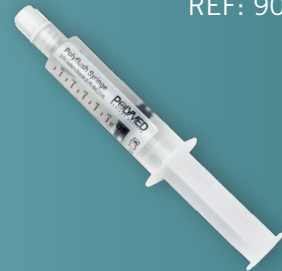
Double Sterile, DS 5ml 30 pcs/box REF: 90316