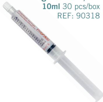
Single Sterile, SS 10ml 30 pcs/box REF: 90318